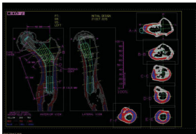
Fig. 2 Computed tomography (CT)-based blueprint of the custom prosthesis designed to accommodate the patient's proximal femoral anatomy.

to be 15 degrees of anteversion with respect to the femoral condyles unless the patient's native anteversion was greater than 15 degrees. In these cases, the stem was designed to match the native femoral version. The acetabular components used were either Harris-Galante II or Trilogy (Zimmer Biomet).