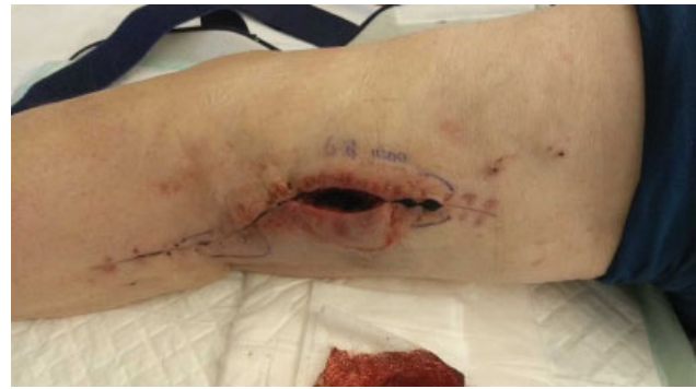
Fig. 2 Photograph after opening and cleaning the infected left popliteal aneurysm. Delayed wound healing can be seen and central wound separation after staple removal. Secondary wound healing was later seen at the outpatient clinic.

Oral ciprofloxacin was switched to intravenous meropenem for wider pathogen coverage at admission. Puncture of the left PAA was done 8 days after admission. Culture of the aspirated material revealed Listeria monocytogenes only intermediately sensitive to meropenem, but sensitive for amoxicillin and cotrimoxazole, after which the antibiotic regimen was changed to this combination. After this switch, the fever subsided. The left PAA sac was opened surgically and cleaned ( \rightarrow Fig. 2). Amoxicillin was administered for 4