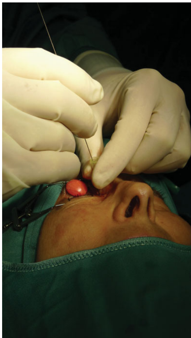
Fig. 1 Using the Seldinger technique, place the guidewire through and down the lumen of the needle. Apply gentle finger pressure on the guidewire to maintain position in the anterior ethmoid or in the nasal cavity while removing the needle.