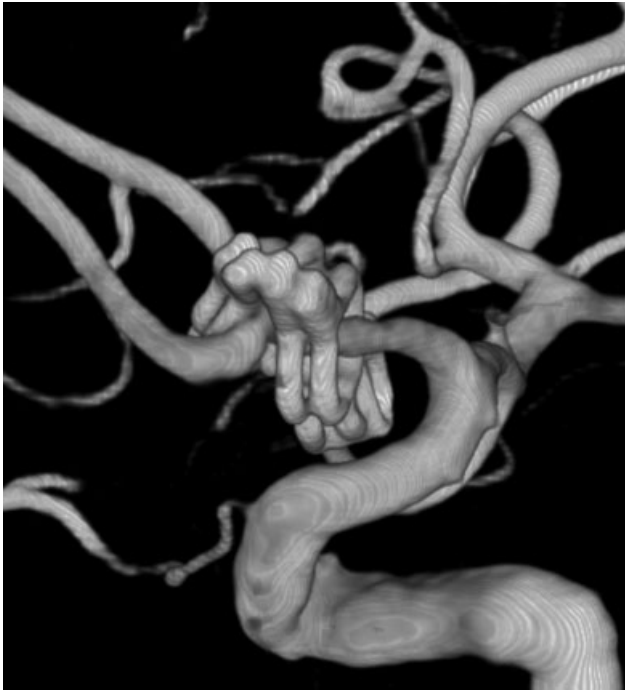
Fig. 3 Postoperative angiography.

A1. Following this artery, we identified the optic chiasm and ACoA complex (► Fig. 2B ). Lamina terminalis fenestration 8 and opening of Lilliequist membrane allowed release of cerebrospinal fluid (CSF). Partial gyrus rectus resection 9 was necessary to expose the bilateral A2. The origin of the recurrent artery of Heubner was localized at the proximal A2. A retractor was placed under the medial frontal lobe with gentle traction. Transitory clipping of both A1 arteries (<5 minutes of total ischemia time) was performed (► Fig. 2C ), and dissection of the aneurysm neck extended medially to the ipsilateral A1–A2 junction (► Fig. 2D ). Under direct visualization of the recurrent artery (► Fig. 2E ), a fenestration tube was completed with two 4 mm length Yaşargil aneurysm fenestrated clips (Aesculap AG & Co., Tuttingen, Germany) over the A2, and two 6 mm length fenestrated clips over the A1 (► Fig. 2E ). Microdoppler sonography Mizuho Surgical Probe (Mizuho Inc., Tokyo, Japan) confirmed flow on both A2s, and absence of flow in the aneurysm sac.