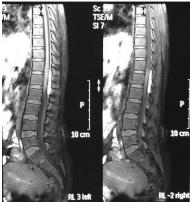
Fig. 1 MRI spine sagittal cuts showing extradural broad based ellipsoid lesion measuring 50 \times 9 mm along T12–L2 vertebra displacing the dura anteriorly and T1 hyperintensity. L, lumbar; MRI, magnetic resonance imaging; RL, right to left; sc, section; sl, slice; T, thoracic; tse, turbo spin echo.

On the basis of clinical evaluation and MRI report, the patient was planned for urgent decompression in emergency operation theater. After preoperative marking of D12–L2 vertebral levels under fluoroscopic guidance, midline exposure done and paraspinal muscles elevated upto medial edge of transverse processes on both sides with the help of Cobb's and broad osteotome. Intraoperatively, bilateral complete laminectomy of L1 vertebrae was done with removal of ligamentum flavum, a well-defined firm organized hematoma dark reddish black in color ( 5 \times 1 cm) was seen over the dura which was removed ( Fig. 2 ) and checked for adequate decompression utilizing infant feeding tube. Sample removed was sent for histopathological examination reported as organized hematoma. Postoperatively, patient recovered rapidly in terms of neurological deficit and was discharged on 10th postoperative day with almost complete neurological recovery and improved bladder bowel incontinence. At the time of discharge (10th postoperative day), patient regained power of 4/5 from 0/5 preoperatively, improved tone, sensory improvement by 80%, and regained bowel bladder control. At last follow-up of 2 years, patient recovered completely in terms of functional and neurological