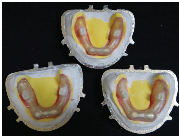
Fig. 2 Thermoplastic denture bases at different thickness.

Specimens were stored in distilled water for 7 days before being thermocycled at 5 to 55°C for 5,000 cycles (30 seconds dwell time). Specimens were then subjected to a 400,000 load regime which is equivalent to using a denture for 20 months. 13 The average fatigue load has been cited as 43 to 100 N. 14 In line with this, vertical loading of 98 N was used in this study and hence the loading delivered to the first molar on the one side was approximately 49 N. Dynamic loading was performed (CS-4.8; SD Mechatronik, Feldkirchen-Westerham, Germany) in a chewing simulator (►Fig. 3) with 1.2 Hz in distilled water.