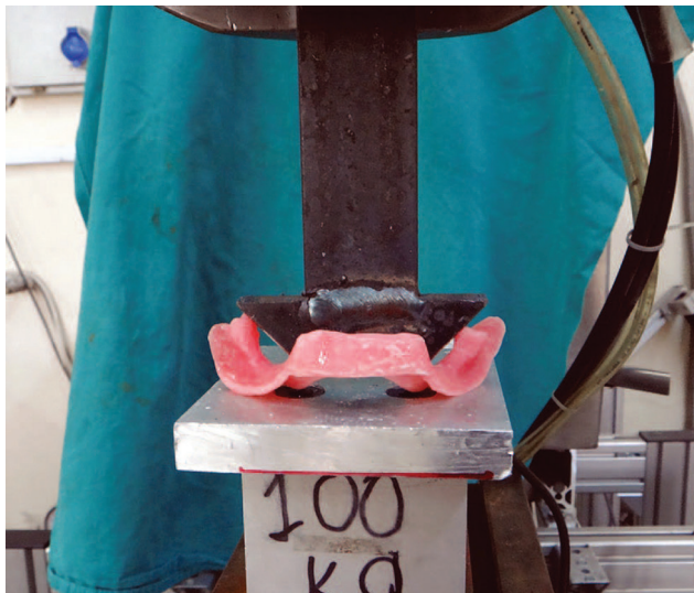
Fig. 4 Fracture apparatus which mimics the mandibular bending in horizontally and vertically.

A concentric cyclic loading was performed. Dynamic loading performed vertically 2 mm away from the central fossa with 2-mm horizontal sliding motion for imitating chewing procedure. Unbroken specimens were then loaded until fracture by a universal testing machine (MTS, 858 mini Bionix II, Eden Prairie, Minneapolis, United States) at a crosshead speed of 2 mm/min (► Fig. 4). During the natural chewing function, especially molar clench, mandible shows horizontal and vertical bending and this function causes torsion of the mandible horizontally. 15 To mimic horizontal and vertical bending of the mandible, a stainless steel trapezoid tip with a 45° base angle was designed. The static load applied through this trapezoid tip. This trapezoid tip applied a simultaneous and equal static load to the lingual surfaces of the first molar teeth at an angle of 45° to imitate static loads occurring in a natural molar clench (► Fig. 5).