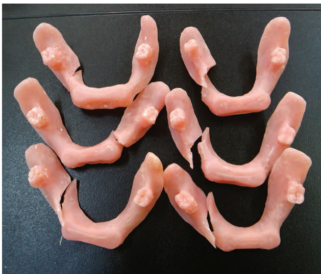
Fig. 5 Sample of fractured fiber specimens.

All tests were performed using statistical software (IBM SPSS, Version 22.0, Armonk, New York, United States). The distribution of the test results was evaluated using the Shapiro–Wilk test. Differences in mean fracture resistance among the groups were compared using the one-way analysis of variance (with post hoc Tukey’s honestly significant difference test) and Student’s t -tests ( \alpha = 0.05 ).