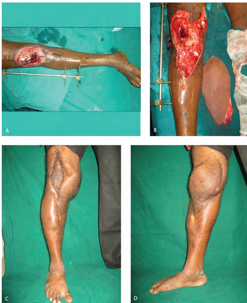
Fig. 6 (A) Defect over the knee joint. (B) Defect with free anterolateral thigh flap. (C) Postoperative photo—front view. (D) Postoperative photo—medial view.