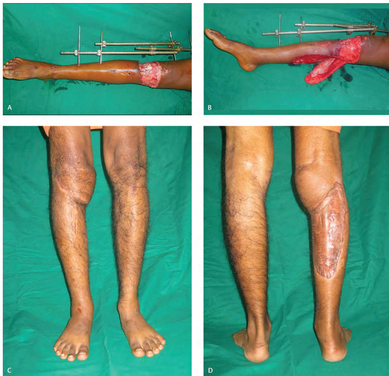
Fig. 4 (A) Defect over the knee joint. (B) Defect with gastrocnemius myocutaneous flap. (C) Postoperative photo—front view. (D) Postoperative photo—donor site.

as a pedicled flap for defects around the knee. The saphenous artery is identified by its close proximity to saphenous nerve. But there are variations in anatomy with origin of this artery arising from superficial femoral artery in some patients. 39 Similar to medial sural artery flap this can also be raised as a pedicled flap to cover the knee defects.