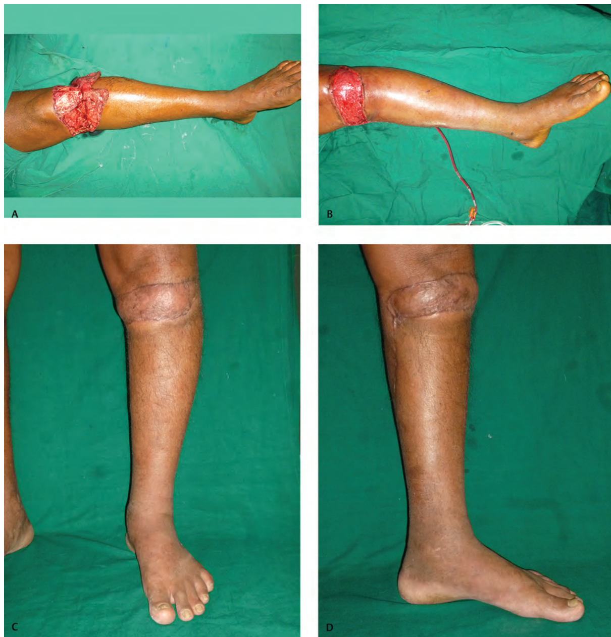
Fig. 3 (A) Defect around knee joint. (B) Gastrocnemius flap covering the defect. (C) Postoperative photo—front view. (D) Postoperative photo—medial view.