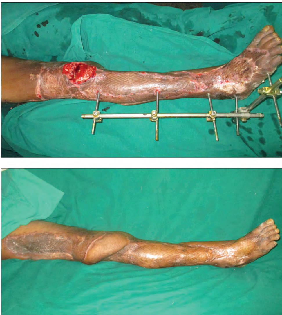
Fig. 5 (A) Defect over knee joint. (B) Defect covered with reverse anterolateral thigh flap—postoperative photo.