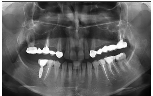
Fig. 1 Marginal bone-level measurement by ImageJ program.

The distribution of marginal bone loss among different groups was also assessed ( ► Table 4 ). In total, 47.5% of all implants showed no bone loss. In Group A, out of 198 implants, 138 (70%) of them showed no bone loss. Taking