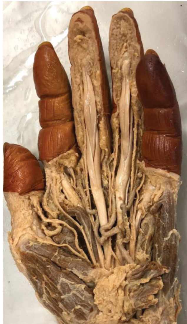
Fig. 4 Dissection of the left hand showing the presence of all digits.

In cleft hand deformity, the bone abnormalities are more frequent than those of soft tissues. They include fusion of adjacent metacarpals, bony bridges across the digits, and proximal phalanx having articulation with two metacarpals. Carpal bones may also show abnormalities. 7 In our case, the three phalanges of the middle finger were absent. There were no other bony abnormalities. Generally, the flexor and extensor tendons of the missing fingers fuse with each other to form tendinous loops over the rudimental carpal or metacarpal bones. The altered bony configuration may lead to extrinsic and intrinsic muscle abnormalities. 7 In our case, the flexor and extensor digital tendons are inserted over the head of the metacarpal bone of the missing middle finger. The 2 nd and 3 rd lumbricals showed variations in their distal attachment.