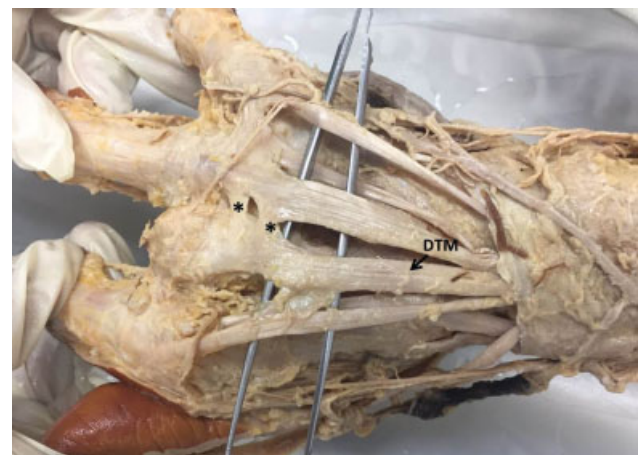
Fig. 2 Dissection of the right hand showing the distal attachment of the extensor digitorum tendon of the middle finger (DTM) over the head of the 3 rd metacarpal bone. Note the tendinous interconnections (asterisk) between the extensor tendons of the ring finger and the missing middle finger.

Although cleft hand has many variations, absence of the central portion of the hand is the most common feature of this condition. Deficiency of the central portion may include absence of phalanges, of a whole individual digit, or of all digits. The palmar cleft can be shallow or deep, depending upon the growth of the remaining metacarpal bones. Usually, the wider clefts are associated with an overly adducted or deficient thumb. 4 Classically, the cleft hand is classified into two types: typical and atypical. The typical cleft hand is usually V-shaped, bilateral, involves the foot and is presented as a syndrome along with other anomalies such as anencephaly, cleft lip, and cleft palate. This type of anomaly usually displays a familial inheritance. On the other hand, the atypical cleft hand is usually U-shaped, unilateral, sporadic, only involves one limb, and often the metacarpals are absent and the thumb and little finger are hypoplastic. It is not associated with any other anomalies. 3 Currently, the atypical cleft hand is referred to as symbrachydactyly. 4 The condition is mainly due to a developmental arrest in the formation of the phalanges and of the metacarpals, and usually two