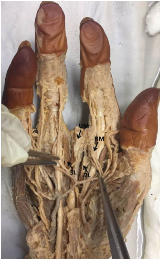
Fig. 3 Dissection of the right hand showing the distal attachment of the 2 nd lumbrical (2L) and of the 3 rd lumbrical (3L). Note the position of the 2 fibrotic masses: ulnar mass (UM) and radial mass (RM) at the base of the palmar cleft.

central digits are involved. 2 The remains of the missing finger will still possess some active movement. The present case may fall under the atypical category due to it being unilateral and having a U-shaped cleft. However, in the present case, contrary to the classical atypical cleft hand, the thumb, the ring and little fingers are of normal size.