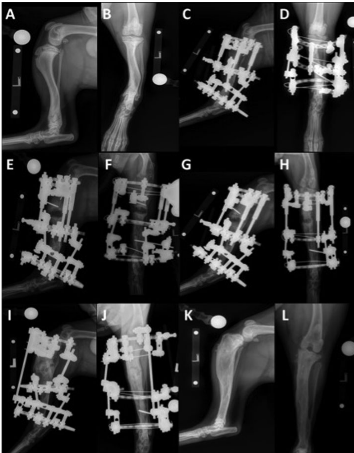
Fig. 2 Preoperative radiographic projections demonstrating tibial deformity (A, B). Immediate postoperative radiographic projections showing TSO and site of linear distraction (C, D). Initial evidence of cortical bridging of the osteotomy and intramedullary infill of regenerate bone (E, F). TSO site demonstrating radiographic healing by day 35 (G, H). Appropriate left pelvic limb tibial length was confirmed by orthogonal radiography and computed tomography at day 68 (I, J). Radiographic projections at 12 months postoperatively (K, L).

1.6 mm Kirschner wires were inserted percutaneously into the mid-tibia and distal tibia. A 5 cm incision was then performed medially at the level of the mid-tibia to allow visualization and access to the bone. Correction by true spherical osteotomy was performed in the distal tibia at the level of the CORA (~Fig. 3A), 4.9 cm proximal to the talocrural joint, utilizing an 18 mm