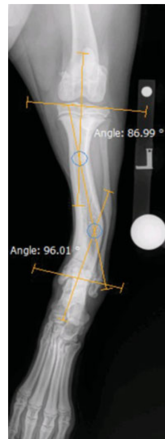
Fig. 1 Preoperative craniocaudal radiographic projection identifying a multiplanar, biapical, compensatory tibial growth deformity, with distal tibial recurvatum and varus. Angle measurements are representative of mean tibia joint orientation angles, as measured in Labrador Retrievers, 19,20 to identify centre of rotation of angulation locations.

The centre of rotation of angulation (CORA) method and the mean mMDTA, mMPTA, mCdPTA and mCrDTA in Labrador