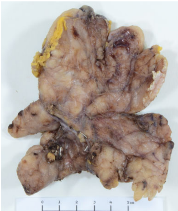
Fig. 2 Thymectomy specimen showing a measuring 124 × 110 × 25 mm lobulated cream surface without a discrete mass.

Anterior mediastinal masses are encountered uncommonly in routine clinical practice. They incite a broad but relatively