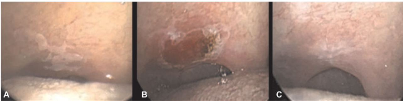
Fig. 2 The picture shows a leukoplakia vaporization on soft palate by carbon dioxide (CO 2 ) laser. (A) Lesion before vaporization. (B) Lesion just after vaporization. (C) Lesion 3 weeks after vaporization.