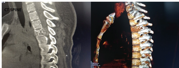
Fig. 2 D3 vertebral body destruction with adjacent soft tissue thickening. CT, computed tomography.