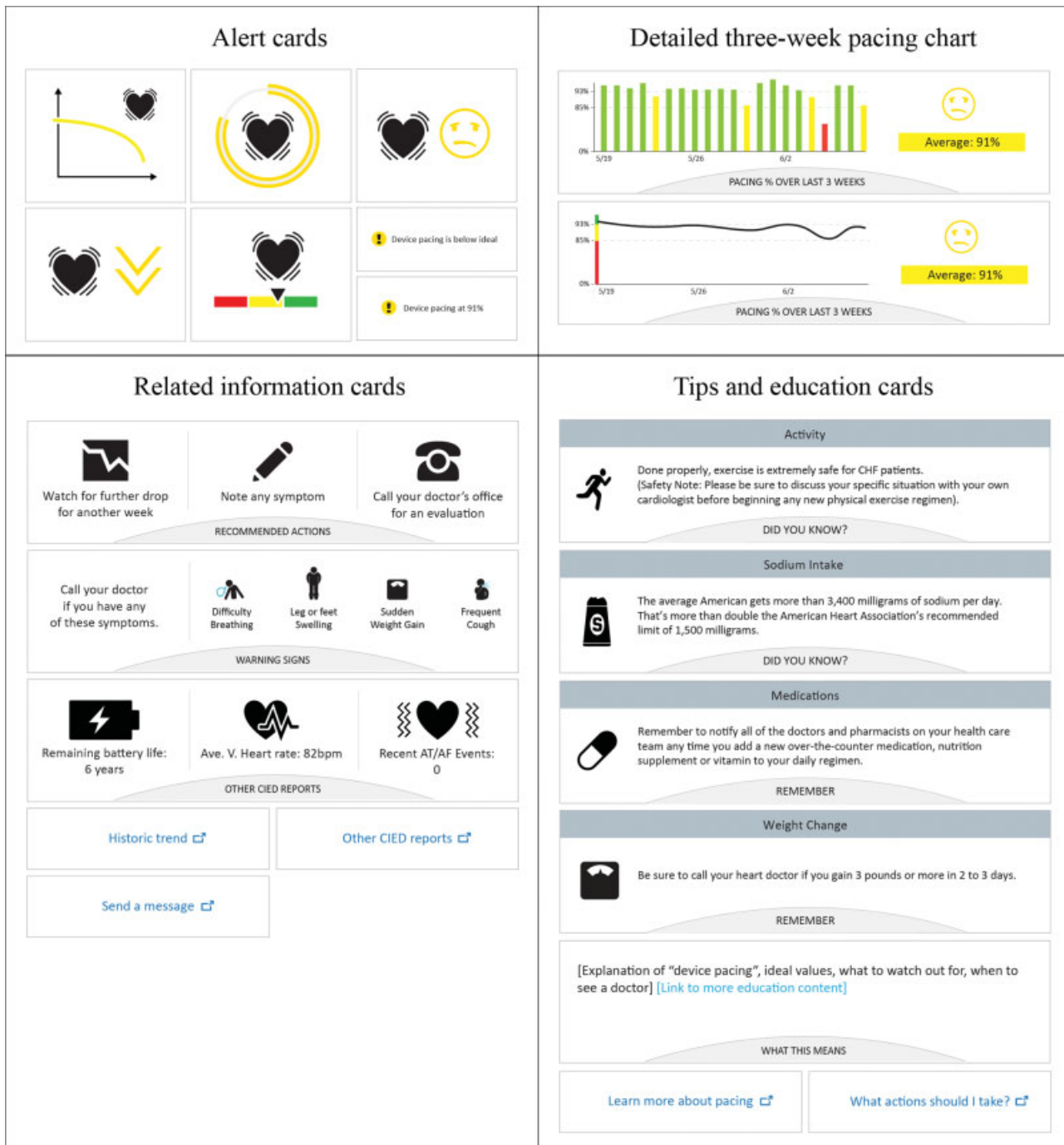
Fig. 2 Cards available to participants.

board) or Additional Information display (larger bottom section). Moderators addressed only content and placement choices that were not consistent among all teams and invited each team to provide their rationale so the others could discuss and reevaluate.