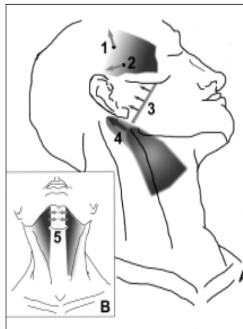
Figure 1: A: a schematic representation of the triplanar dissection and tension lines. 1 and 2: sutures of the temporalis fascia. 3: SMAS section line and tension direction. 4: platysmal tensioning direction. B: (in the cartouche) treatment of platysmal bands.

The neck was widely undermined, preceded by reduced pressure submental liposuction when necessary. When marked neck tissue laxity was present, the platysma was released from the sternocleidomastoid muscle and dissected for about 5 to 6 cm, and its margin was secured with non-absorbable (5.0 Polypropylene) stitches to the mastoid eminence (Figure 1, A4). After both sides had been properly exposed, a 2 cm wide SMAS band from the zygomatic eminence to the ear lobule insertion (Figure 1, A3) was either resected or plicated (depending on the amount of tissue to be redistributed) and sutured with non-absorbable stitches (5.0 Polypropylene). The traction vector was therefore directed from the oral rim to the auricularis tubercle in the midface and from the thyroidal cartilage to the mastoid eminence in the neck. SMAS treatment was always performed after both sides had been fully dissected, in order to calibrate and balance the tension,