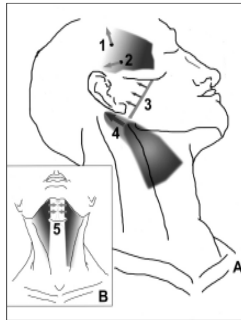
Figure 1: A: a schematic representation of the triplanar dissection and tension lines. 1 and 2: sutures of the temporalis fascia. 3: SMAS section line and tension direction. 4: platysmal tensioning direction. B: (in the cartouche) treatment of platysmal bands.

The neck was widely undermined, preceded by reduced pressure submental liposuction when necessary. When marked neck tissue laxity was present, the platysma was released from the sternocleidomastoid muscle and dissected for about 5 to 6 cm, and its margin was secured with non-absorbable (5.0 Polypropylene) stitches to the mastoid eminence (Figure 1, A4). After both sides had been properly exposed, a 2 cm wide SMAS band from the zygomatic eminence to the ear lobule insertion (Figure 1, A3) was either resected or plicated (depending on the amount of tissue to be redistributed) and sutured with non-absorbable stitches (5.0 Polypropylene). The traction vector was therefore directed from the oral rim to the auricularis tubercle in the midface and from the thyroïdal cartilage to the mastoid eminence in the neck. SMAS treatment was always performed after both sides had been fully dissected, in order to calibrate and balance the tension,