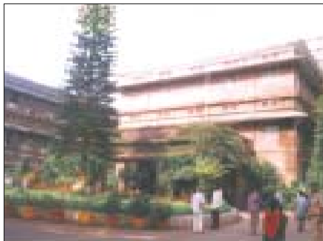
Figure 1a: Seth G. S. Medical College and K.E.M. Hospital