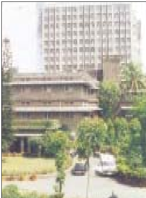
Figure 1c: Seth G. S. Medical College and K.E.M. Hospital

between the two departments at this stage, but as soon as the present new Neurosurgery OT Complex was commissioned, we were vested with the exclusive use of this OT complex.