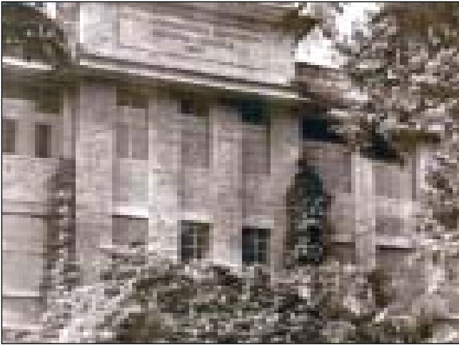
Figure 1b: Seth G. S. Medical College and K.E.M. Hospital