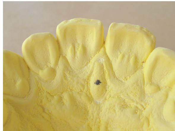
Figure 2. Marked midpoint of the incisive papilla on stone cast.