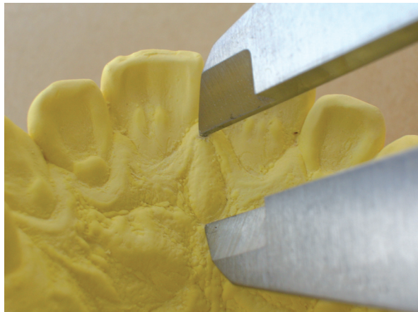
Figure 1. Measurement of the distance between most anterior and posterior borders of the incisive papilla on stone casts.

A common average vertical position of the maxillary anterior teeth to the constant landmarks has been found by measuring lots of casts of natural healthy teeth. It is important to orient the stone casts in a standardized manner during measurements so that the results achieved can be applied when artificial teeth are being set in complete denture bases. The occlusal plane is a common reference for mounting stone casts and in general, occlusal plane done parallel to the bases of stone cast in standardize manner. Fu et al 22 found the pterygomaxillary notch-incisive-papilla plane (HIP) tends to be parallel to the