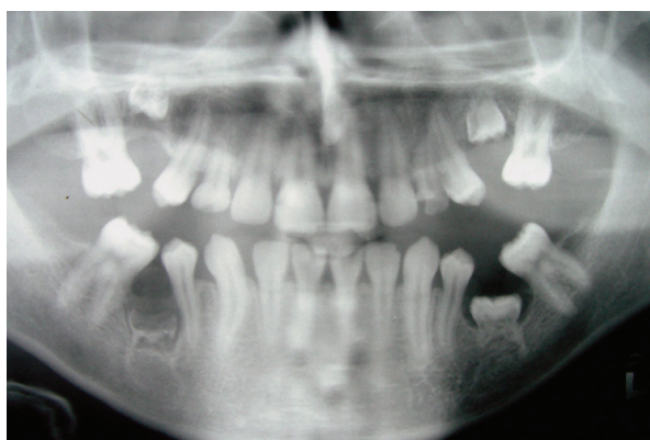
Figure 1. The panoramic radiograph of Twin HDH.