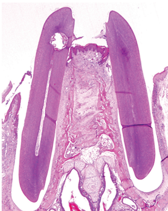
Figure 2. A histological section (4X magnification) that histomorphometric evaluations were done.

All data were analyzed with the statistical package for social sciences, 13.0 (SPSS for Windows, SPSS Inc, Chicago, Illinois, USA). Descriptive statistics are given as mean, standard deviation, standard error, minimum and maximum. The group differences were studied by the Mann-Whitney-U test (with the Bonferroni correction). P-values less than .05 were evaluated as statistically significant.