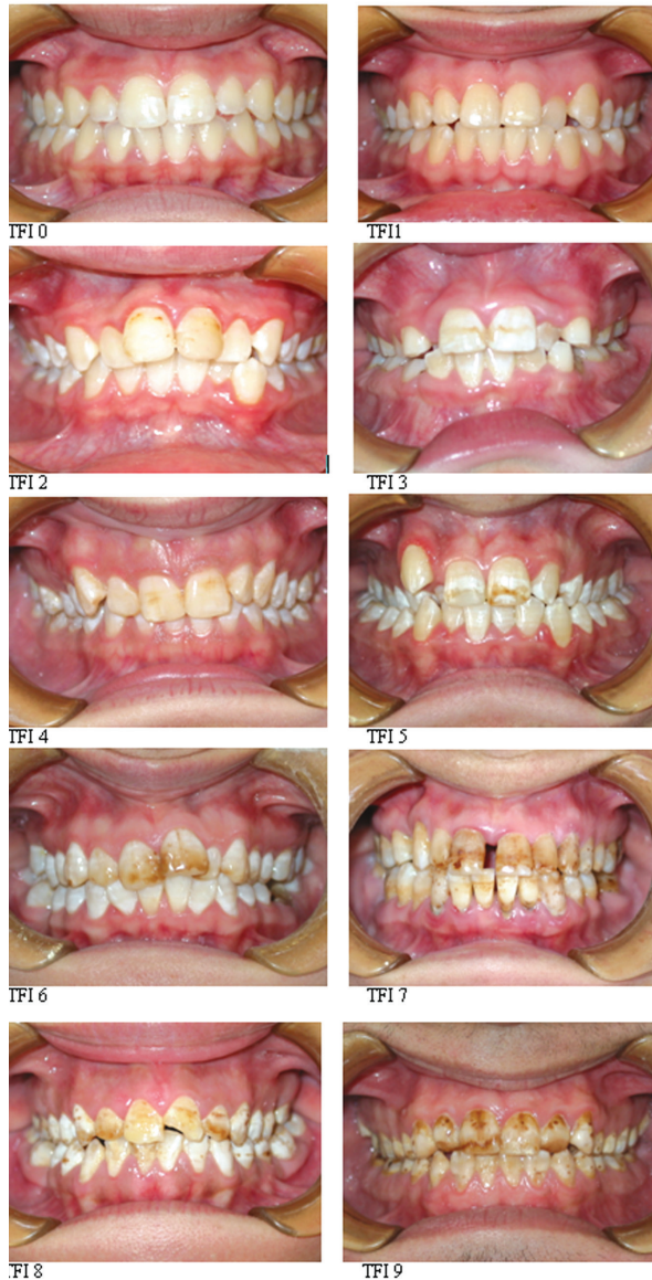
Figure 1. Thylstrup and Fejerskov Fluorosis Index (TFI) samples.

Girls showed statistically significant difference in NSAr ( P < .05 ), NAPog ( P < .05 ), and ramus height (Arkk) ( P < .01 ) in between two groups (Table 4) whereas articular angle (SArGo) ( P < .001 ), ArGoGn ( P < .05 ), chin angle (IdPog-MGo) ( P < .001 ) and NA-