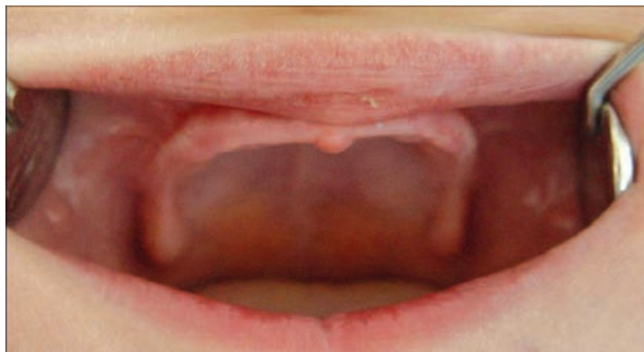
Figure 3. Intraoral view of the upper jaw.