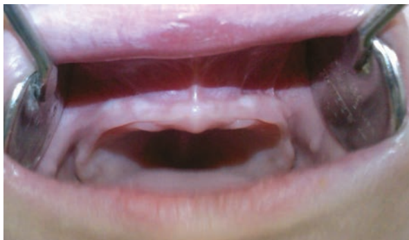
Figure 10. Intraoral view of the upper jaw.