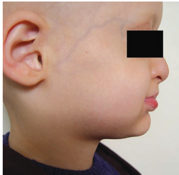
Figure 9. Profile view of the patient.