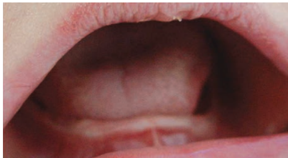
Figure 4. Intraoral view of the lower jaw.