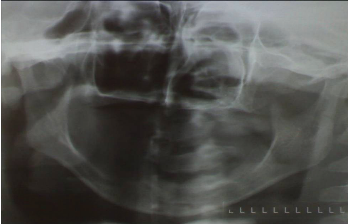
Figure 5. Panoramic radiograph confirming complete absence of teeth.

Dentures were fabricated following the same procedures described for the first case. Primary