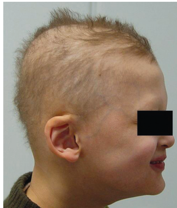
Figure 7. Profile view after treatment.