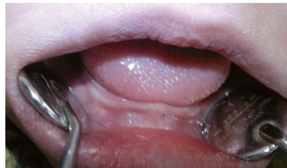
Figure 11. Intraoral view of the lower jaw.