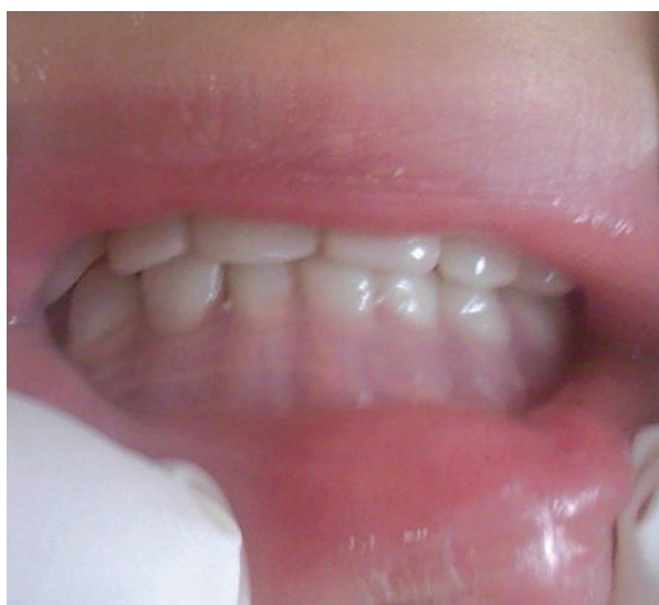
Figure 15. Intraoral view after treatment.

In case 2, early prosthetic treatment led to significant improvements in appearance, speech, and masticatory function. During the first month following the initiation of prosthetic treatment, it was difficult for the 3-year old patient to adapt to the complete dentures; however, he was accustomed to using the dentures and was able to eat adequately within a few months. Although dentures are poor alternatives to healthy dentition,