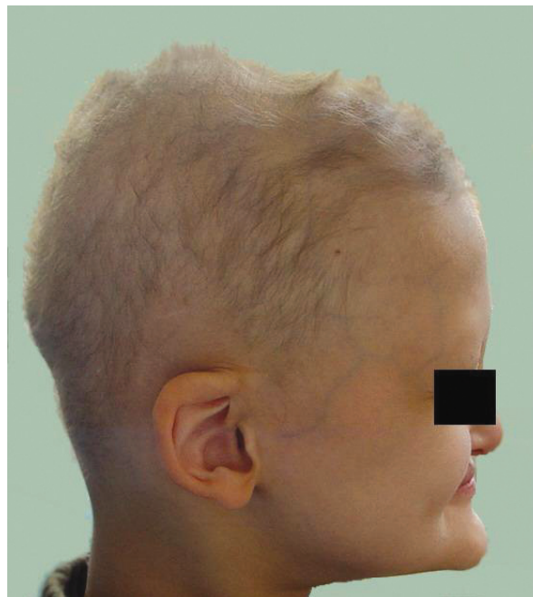
Figure 2. Profile view of the patient.