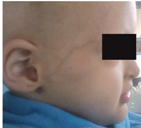
Figure 14. Profile view after treatment.