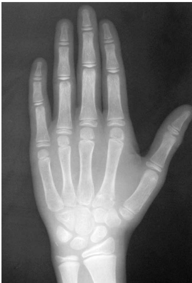
Figure 6. Post-treatment hand-wrist radiograph.

Asymmetrical patients have also been found to have a higher incidence of morphological changes and internal derangement in the TMJ on the shifted side when compared to the non-shifted side, 18 and it has been suggested that the incidence of disk displacement and TMJ disorder symptom on the deviated side is higher than on the non-deviated side. 19 In the case presented here, no symptoms of TMJ disorder were observed either before or after functional appliance therapy.