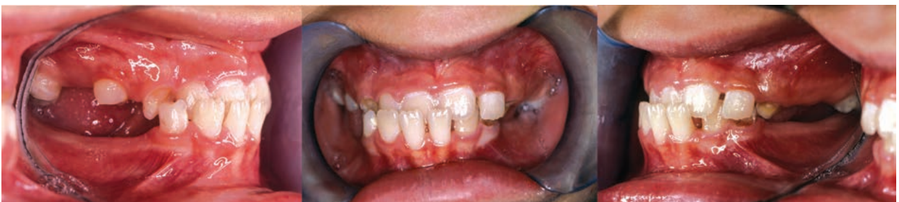
Figure 2. Pre-treatment intraoral photographs