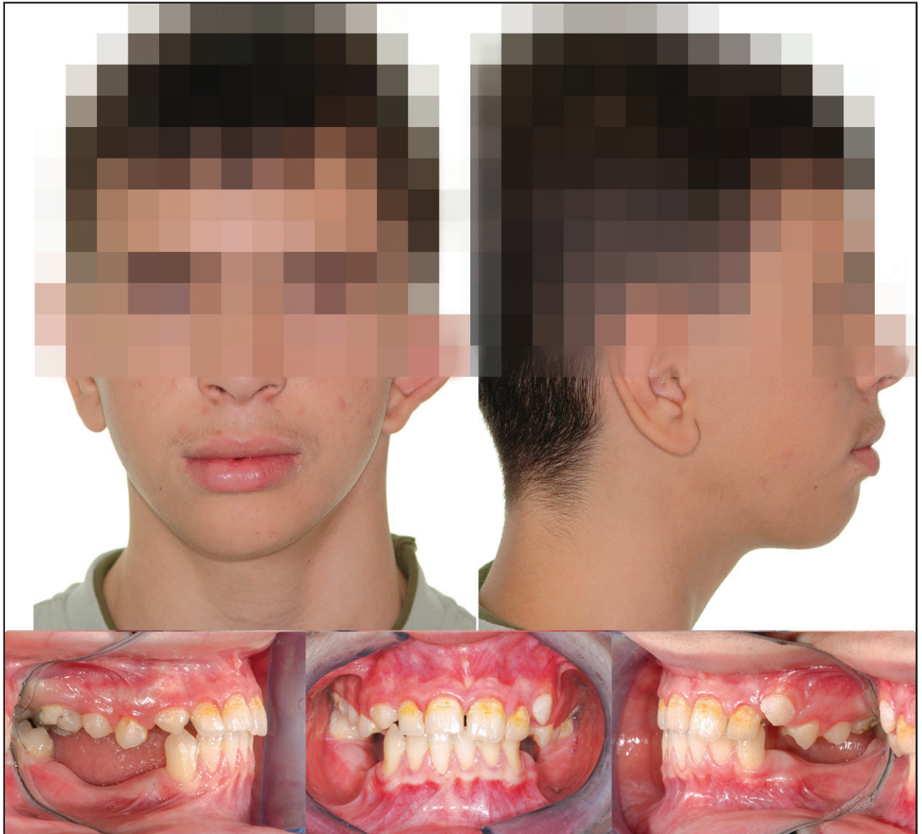
Figure 8. Two years follow-up extraoral and intraoral photographs.