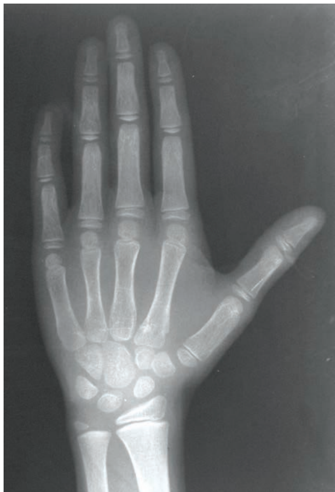
Figure 3. Pre-treatment hand-wrist radiograph.

The management of asymmetry cases involves some of the most challenging treatment planning decisions orthodontists may face. 9 Clinical exami-