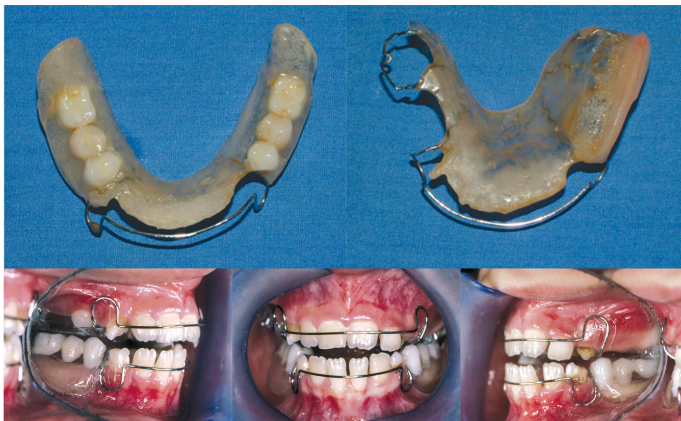
Figure 4. Removable appliances inserted in the mandibular and maxillary arches.