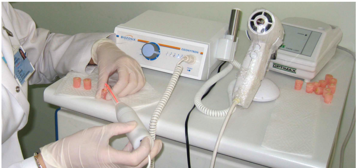
Figure 2. Application of Ozonytron.