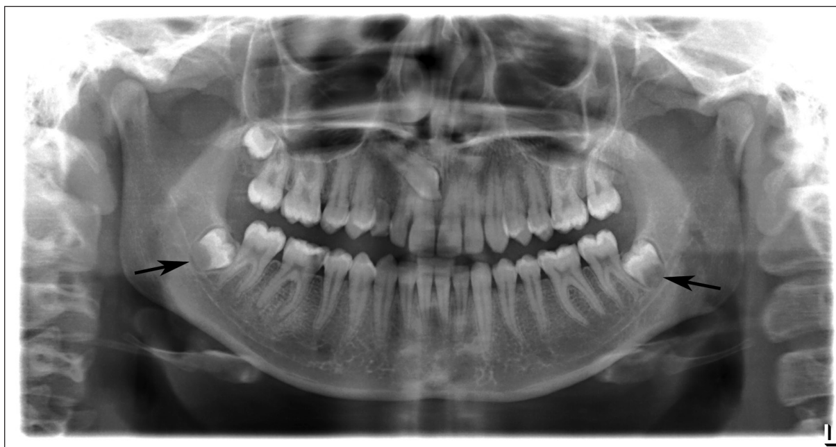
Figure 3. Apexogenesis and maturation stage of third molar teeth.