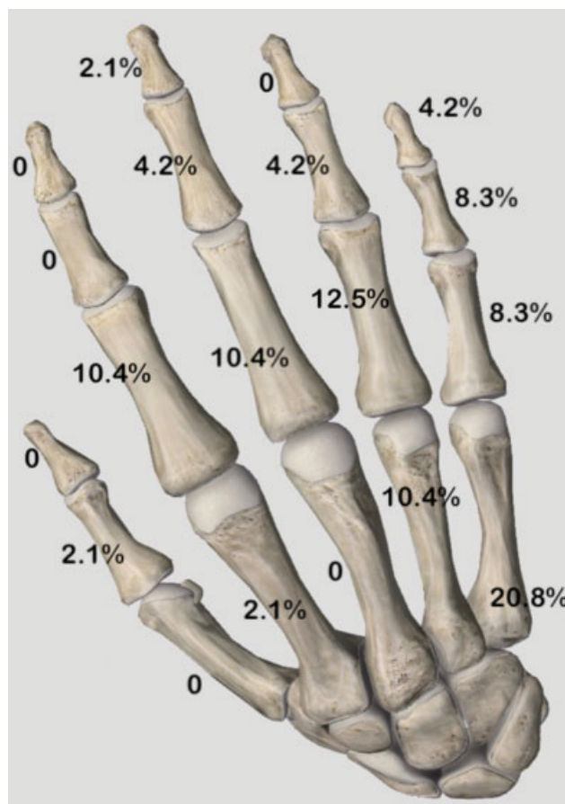
Fig. 3 Distribution of frequencies of enchondromas in each bone of the hand.

The size of the tumors ranged from 0.2 cm 2 to 5.7 cm 2 , with a mean size of 1.7 cm 2 (SD = 1.0 cm 2 ), and there was no significant difference between the distributions of the sizes of the tumors from the female and male (p-value of the Mann-Whitney test = 0.069). Fracture was not associated with the size of the tumor. The mean size of the tumor