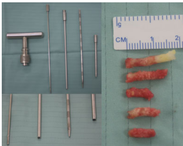
Fig. 1 The Craig needle set used to harvest bone graft, and the harvested bone cylinders.