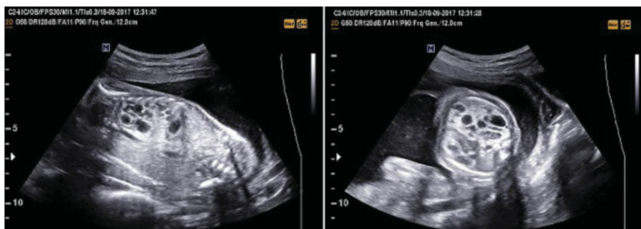
Fig. 1 Prenatal ultrasonographic features of a CPAM case in our series.

The mean maternal age in these 19 cases was 27.5 (19–37 years). We observed that 68.4% (13 out of 19) of the