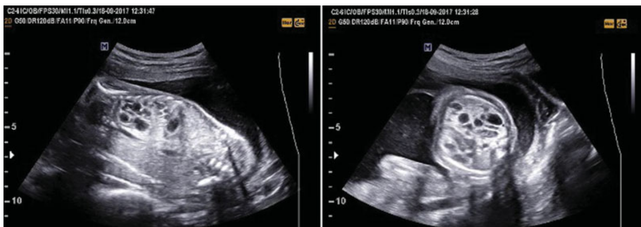
Fig. 1 Prenatal ultrasonographic features of a CPAM case in our series.

The mean maternal age in these 19 cases was 27.5 (19–37 years). We observed that 68.4% (13 out of 19) of the