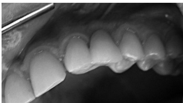
Figure 5. Cemented restoration in the mouth.

Since glass fiber fixed partial dentures have esthetic and economic superiorities, are easy to repair and require no preparation on sound teeth,