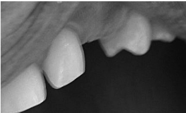
Figure 1. Missing maxillary left canine.