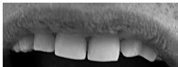
Figure 7. Two year follow-up intraoral view of the restoration.