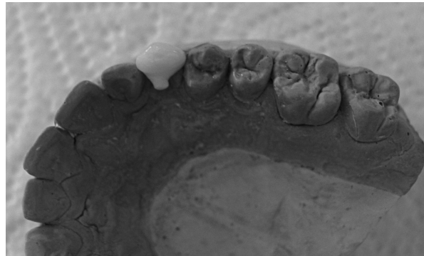
Figure 2. Full ceramic pontic placed on the diagnostic cast.