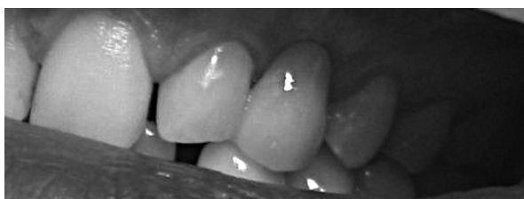
Figure 6. Clinical view of restoration from labial aspect.