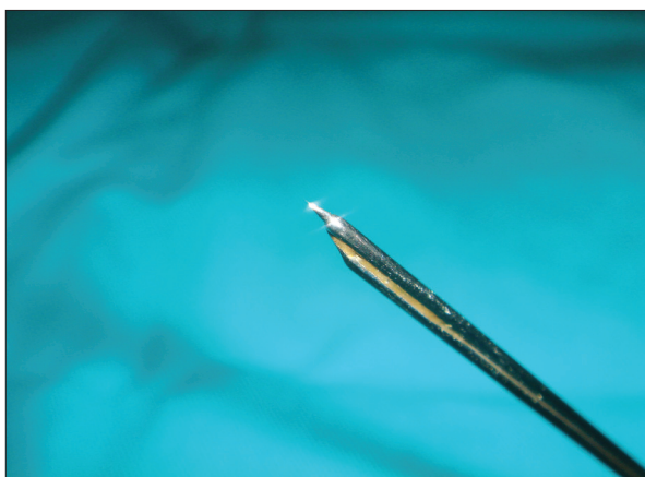
Figure 3. The view of the sharp-tipped trocar inserted into the irrigation tube for the entrance into joint space through skin.