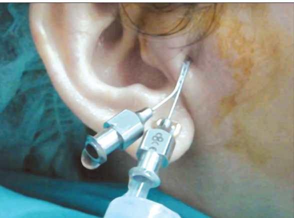
Figure 4. The view of clinical use of the instrument.