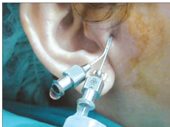
Figure 4. The view of clinical use of the instrument.