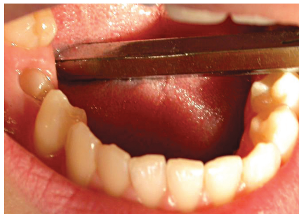
Figure 1. Intraoral view of the patient. Note that only a small cusp of right mandibular 1 st molar can be seen.

In order to assess the position of the inferior alveolar canal and the relationship between the canal and second premolar a coronal, CT was taken (Philips Tomoscan, Netherlands). CT scanning of the mandible consisted of 26 slices with a thickness of 3mm and 1mm slice gap. Relationship of inferior alveolar canal and impacted premolar can be observed in Figure 4. Furthermore the amount of bone volume of the involved section and symmetrical section (to compare the bone volume) calculated from the slices on post processing screen of the system. The bone volume was 8.46cm 3 on the right side compared to 12.75cm 3 on the opposing side which demonstrated that the structural weakness could arise, if molar, premolar and primary second molar were extracted. This could lead to long term problems such as potential pathological fracture