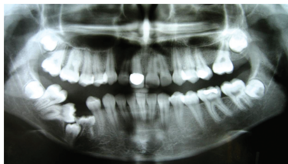
Figure 2. Panoramic radiography of the patient.