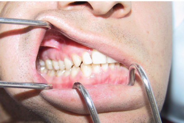
Figure 4. Follow-up period photograph shows maxillary molar teeth in original position.

Not only forceps extraction of a resistant second or third molar but also first molar may result in fracture of the maxillary tuberosity. According to our knowledge, in the literature no maxillary tuberosity fracture case was reported to be associated with the upper first molar extraction. It is suggested that during the forceps