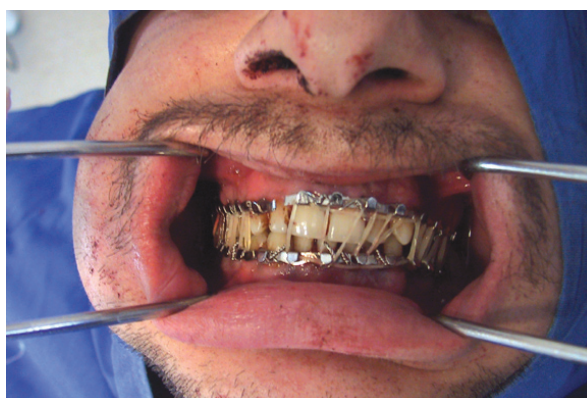
Figure 3. Intraoperative photograph shows bimaxillary fixation with arch bar and elastics.