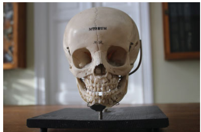
Fig. 2 The skull with developing teeth (moving from primary to permanent).

The unique artifact is the skull with developing teeth (moving from primary to permanent) (→ Fig. 2). Moreover, the museum showcases the sheer diversity of bone anomalies and congenital malformations (diversity of congenital cardiac defects and skeletal deformities), such as metopic (frontal) suture, suture bones, acrocephaly (tower skull); vertebral anomalies: assimilation of the atlas, and bone conrescence. Included in this section are the skeletons