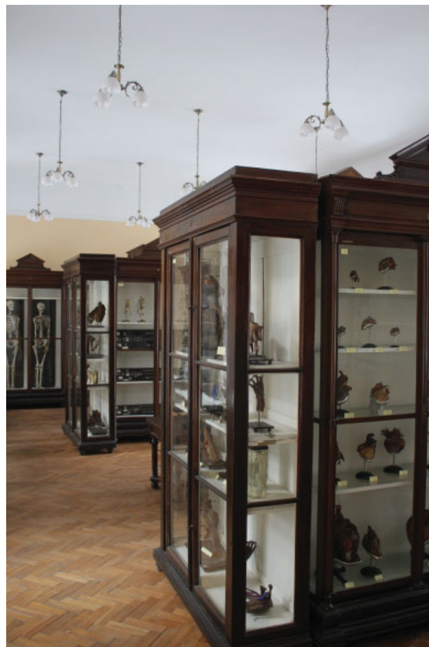
Fig. 4 Authentic cabinets in the third museum hall.