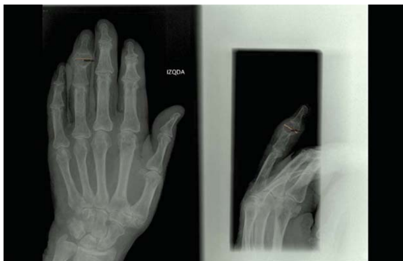
Figure 1 Posteroanterior simple radiography showing the lesion diagnosed 2 years ago as an enchondroma. The tumor was located at middle phalanx of the fourth finger and measured in millimeters.

After discussing the condition with the patient and his family, the surgical removal of the lesion was decided, with amputation of the fourth finger of the left hand. Pathological anatomy grossly described a lesion at a surgical resection piece measuring 6.8 cm at its longitudinal axis, 3.5 cm at its