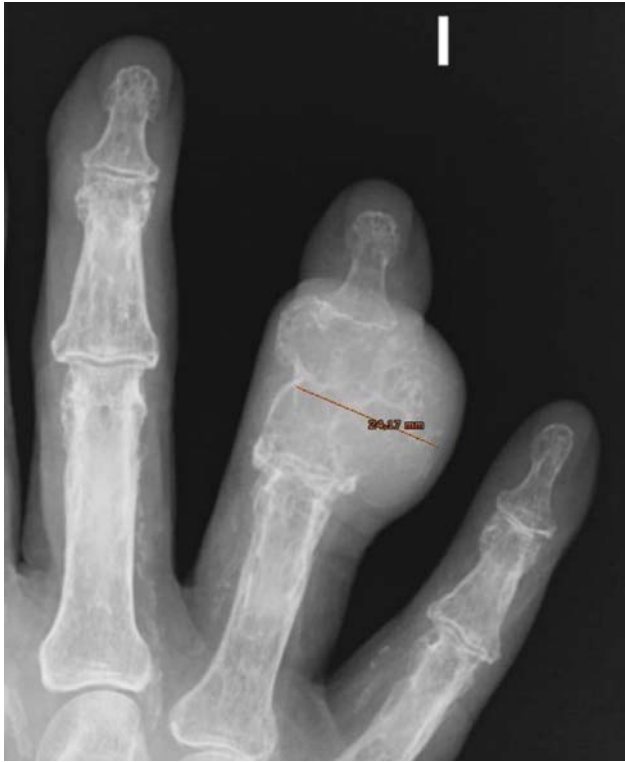
Figure 3 Oblique simple radiography showing an expansive lesion at the middle phalanx of the fourth finger.

transversal axis and 3.4 cm at its dorsoventral axis. The medial region of the piece presented a tumor measuring 4 cm at its longitudinal axis per 3.5 cm at its transverse axis that ulcerates focally on the external lateral surface. When sectioned, the tumor was white, elastic, smooth and homogeneous, with white areas alternating with reddish brown areas, measuring 2.7 cm at its dorsoventral axis per 2.8 cm in its transversal axis. Microscopically, it was a chondroid