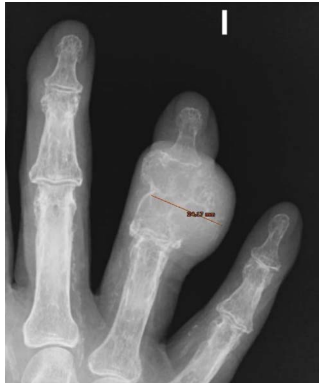
Figure 2 Posteroanterior simple radiography revealing an expansive lesion at the middle phalanx of the fourth finger, with different size and shape but at the same location seen 2 years ago.

A multislice helical CT was performed in the left hand to complete the study of this expansive, lytic lesion affecting the middle phalanx of the fourth finger of the hand. The scan revealed cortical bone thinning, areas of cortical destruction, and small, punctate calcifications within the lesion which were related to the chondroid matrix. The approximate diameter of the lesion was 21 \times 28 \times 25 mm (anteroposterior, transversal, and craniocaudal measurements, respectively). These findings suggested a protruding enchondroma. Although protruding enchondromas appear aggressive, a sarcomatous degeneration could not be ruled out because of the increased size of the lesion and the greater cortical destruction when comparing radiographs taken in January 2011 and October 2013 (►Figure 4)