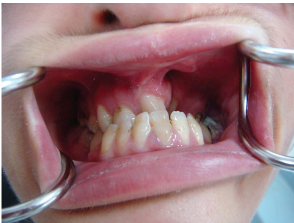
Figure 3. Malocclusion of the whole mouth of the first patient.