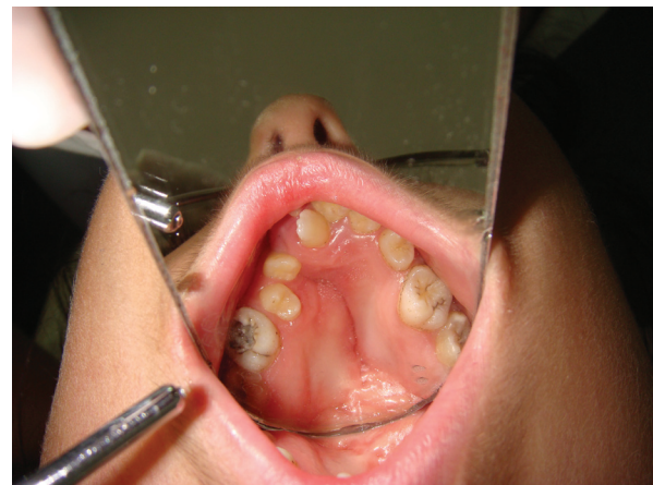
Figure 4. Scars of the cleft palate including the narrow maxilla of the patient no 1.