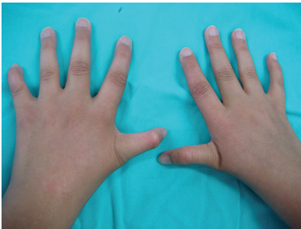
Figure 1. Hypoplastic thumbs of patient no 1, with medial deviations.

A 3-year-old Caucasian girl came to the Periodontology Department, Samsun, Turkey, for a consultation regarding her general dental health