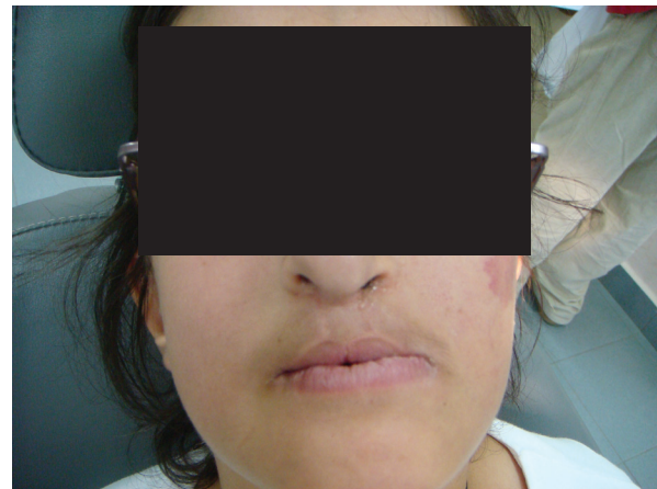
Figure 2. Hemangioma of the left cheek about 1x1 cm in diameter of the first patient.