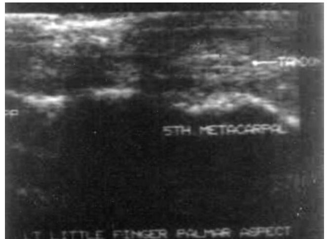
Figure 2: Soft tissue ultrasound showing avulsion of FDP tendon of little finger