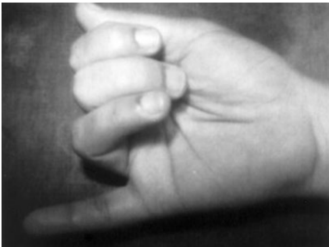
Figure 1: Clinical picture showing attitude of hand after tendon injury

A closed rupture of a tendon may be defined as a rupture that occurs during movement and activity. Closed rupture of a flexor tendon is rare and ring finger is most commonly affected. Clinical observation of patients with this injury reveals that the ring fingertip is usually more prominent or "longer" than any other