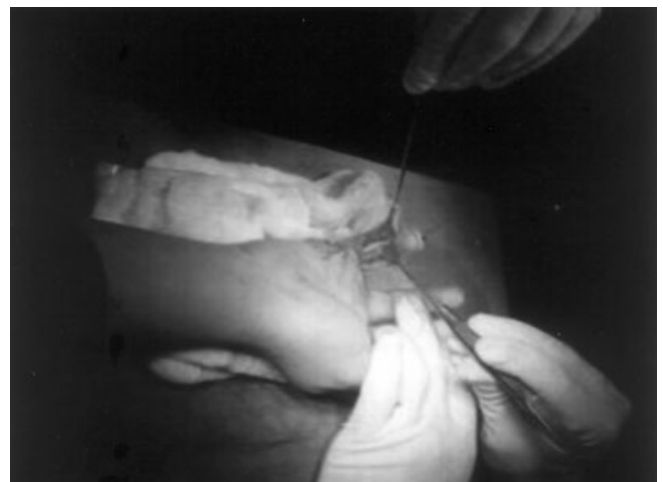
Figure 4: Showing repaired tendon by bunnel's pullout suture