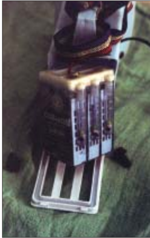
Figure 1: Replica of the low voltage battery of a flash light that caused the blast injury