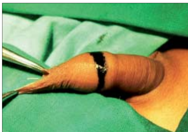
Figure 2: Coronal marking