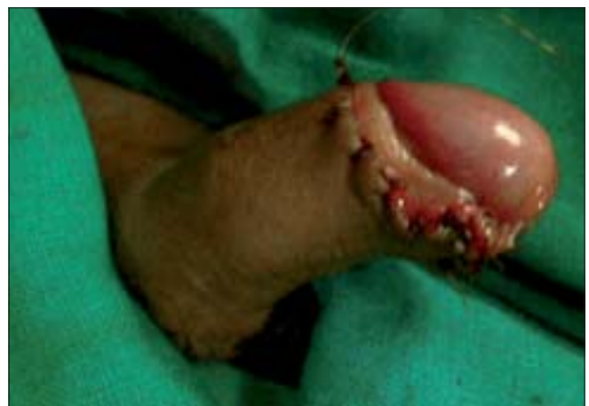
Figure 12: Final closure