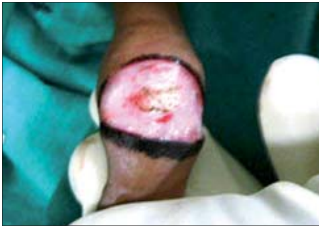
Figure 7: Cut both layers of prepuce