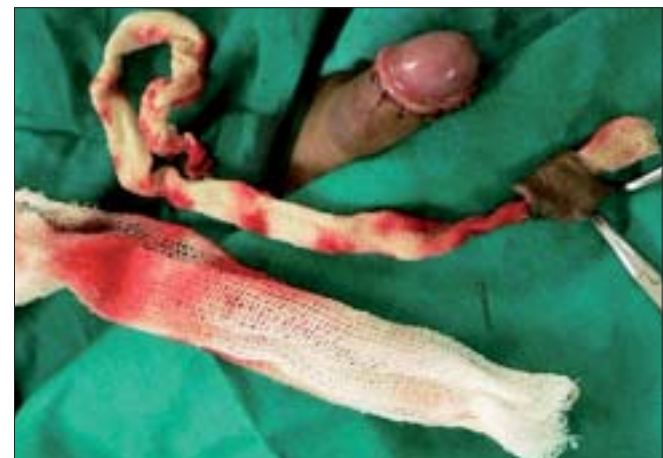
Figure 11: Cuff of excised prepuce and blood loss