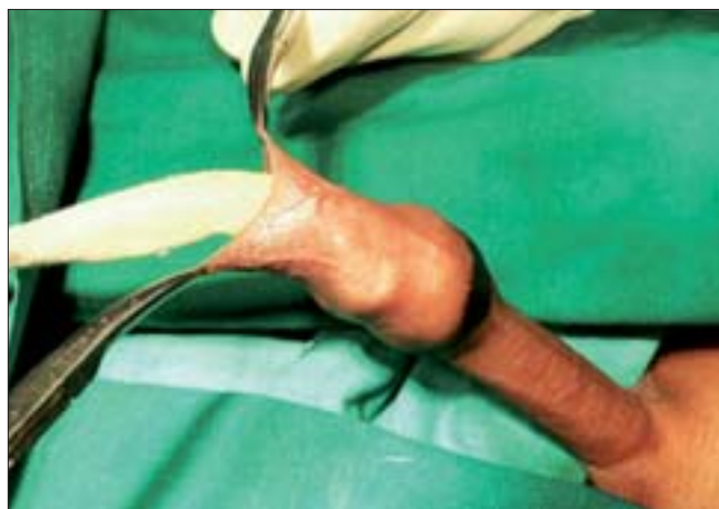
Figure 4: Packing gauge

with 5-0 chromic catgut and the incision was completed by taking care of the frenular artery with a figure of "8" suture. In this technique, all the blood vessels were coagulated before cutting the inner prepuceal layer so the blood loss was minimal [Figures 9-12].