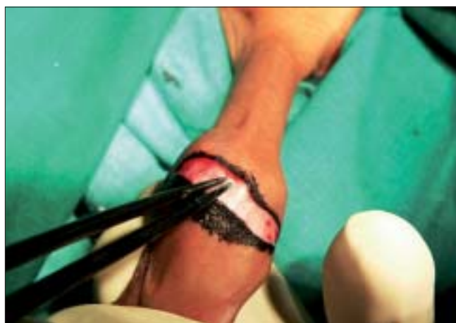
Figure 6: Coagulation of dorsal vein

A local antibiotic cream was applied along the suture line. All the patients received a course of antibiotic (amoxicillin and cloxacillin combination) and analgesics for seven days with a local antibiotic cream application along suture line. Patients were allowed to take bath after the 3 rd postoperative day. All patients were admitted as "day care surgery" and followed up in the outpatient department for three months.