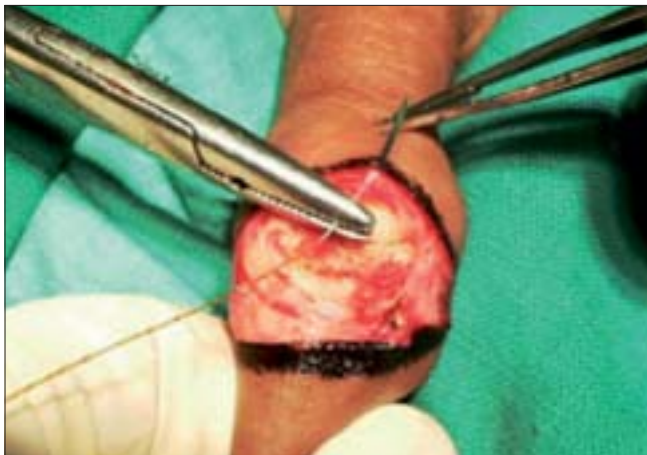
Figure 9: Closure of both layers