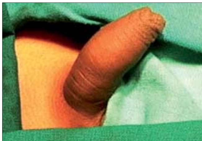
Figure 1: Preoperative photo