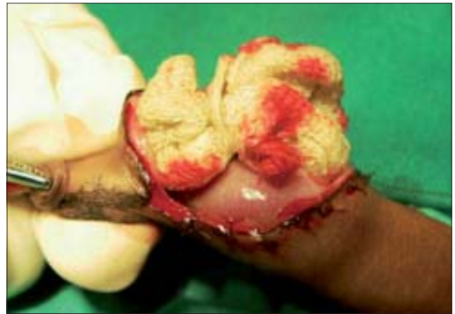
Figure 10: Closure complete