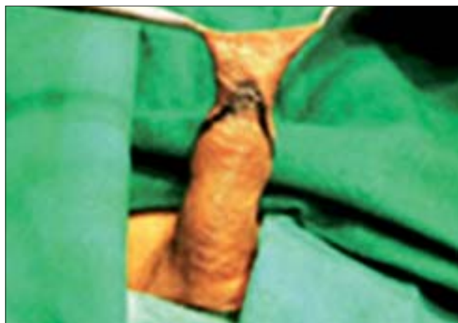
Figure 3: Ventral marking

with 5-0 chromic catgut and the incision was completed by taking care of the frenular artery with a figure of "8" suture. In this technique, all the blood vessels were coagulated before cutting the inner prepuceal layer so the blood loss was minimal [Figures 9-12].