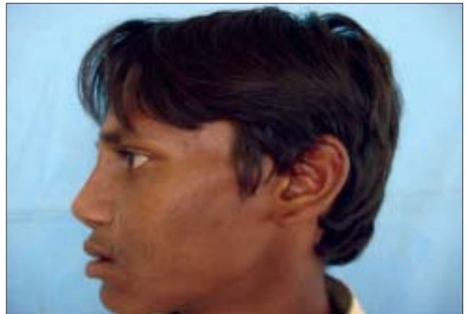
Figure 3b: Postoperative photograph in profile view