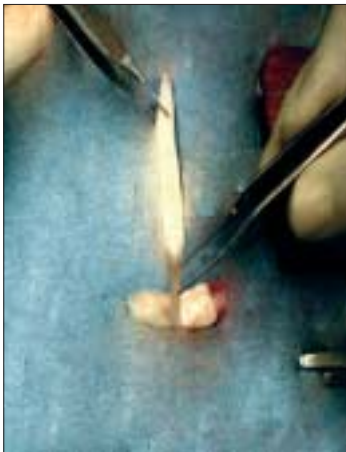
Figure 2a: Cartilage graft carved to desired shape