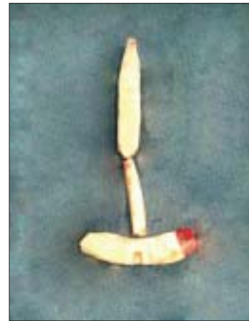
Figure 2b: Cartilage graft in desired shape after temporary fixation