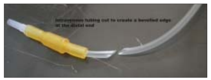
Figure 1: Intravenous tubing cut to leave a distal beveled edge

We have been using this adaptation of a saline-linked bipolar device in our department for more than a year with gratifying results. Its advantages lie in the financial viability (additional cost to patient = Rs 57 only; US$ 1.42), ease of set up, and an absence of the need of an attentive assistant to either irrigate the surgical field or clean the bipolar forceps. During this year of use of this modification, in addition to more effective coagulation due to decreased charring, an added advantage is the precision of the extent of coagulation due to the thermal sink effect of the saline drop at the site of coagulation, leading to controlled heat generation and its even distribution.