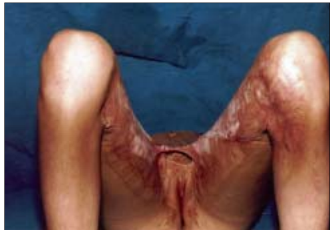
Figure 2: Perineal contracture leading to inability to abduct thighs

was instituted for three days and the area healed well with total take up of the graft [Figures 6 and 7]. Postoperatively, the patients were asked to wear tightly fitting undergarments with sponge padding to prevent contraction of the grafted area. The follow-up period ranged from six months to four years