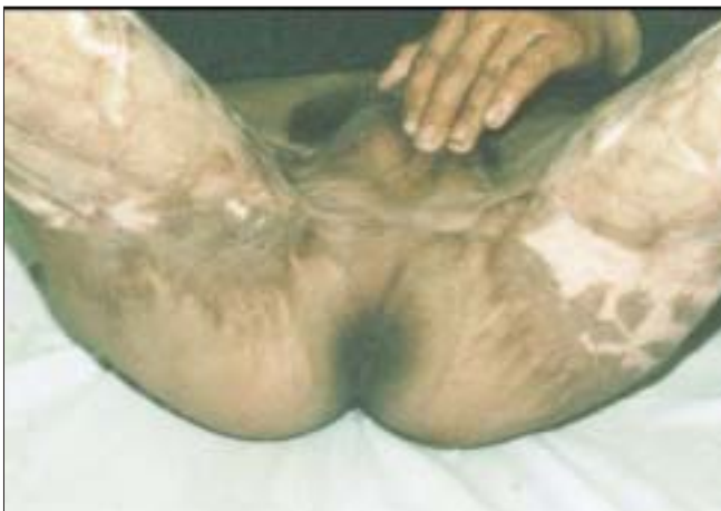
Figure 7: Postoperative photograph of male patient

managed by physiotherapy. Squatting ability improved in all and they were able to perform essential chores that require squatting position.