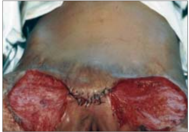
Figure 4: Closer with advancement of skin of abdomen