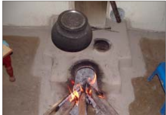
Figure 1: A typical 'Chullah' found in HP

Postoperatively, indwelling urethral catheter drainage