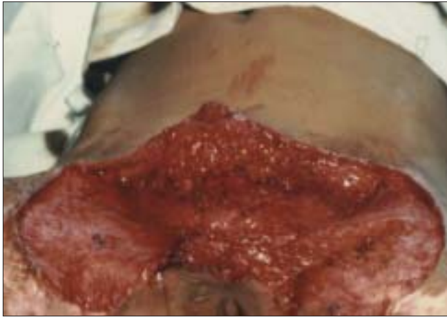
Figure 3: Raw area after excision of contracture