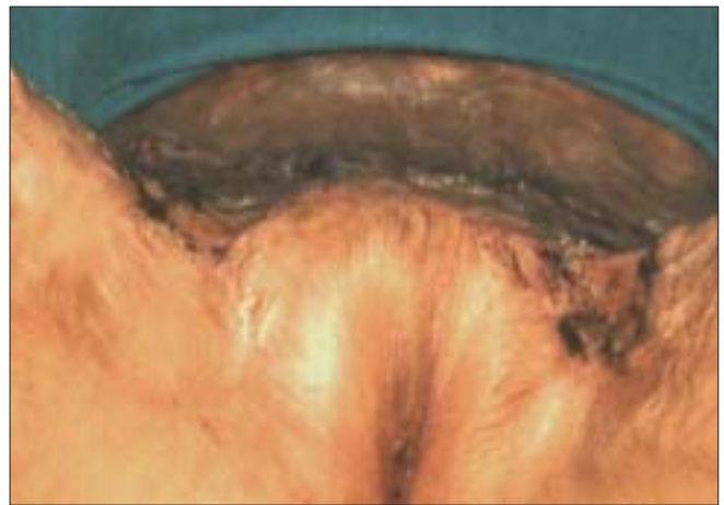
Figure 6: Well healed surgical site