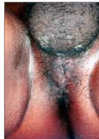
Figure 5: Well healed wound at follow-up

x 0.5 cm 2 sized opening in the perineal region at the level of the bulbar urethra with continuous dribbling of urine. Urine examination showed 8–10 pus cells and growth of Pseudomonas and E. coli sensitive to Amikacin and Ceftriaxone was noted upon culture. He was treated with the above antibiotics until the urine culture became sterile. A fistulogram was taken to examine the fistulous tract, which was seen to be continuous with the bulbar urethra [Figure 3]. Surgical exploration and repair of the fistula were planned. There was healthy and adequate redundant bulbar urethra after excision of the fistulous tract. In contrast to the stricture cases, there was redundant urethral flap secondary to the presence of a large urethral stone in our case. We decided to use the technique of double breasting to repair and reinforce the urethra by utilizing this redundant urethral flap as it would provide an adequate urethral lumen and lax suture line after stripping the urethral mucosa of the redundant flap [Figure 4]. This was further reinforced with reimposition of corpus spongiosa. The wound was