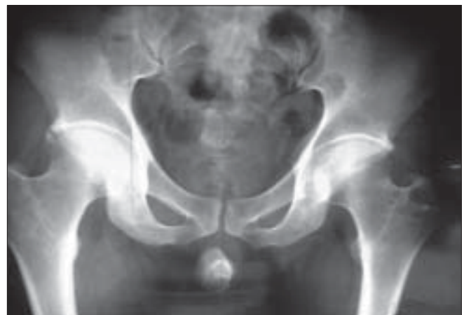
Figure 1: X-ray of the pelvis showing a large urethral stone

A 40 year-old male patient was treated in the emergency room for a large perineal abscess. Examination revealed that he had an approximately 9 x 9 cm 2 tense, tender, fluctuating swelling with the features of acute inflammation in the perineum. The X-ray of the pelvic region showed a large stone in the bulbar urethra [Figure 1]. He underwent incision and drainage of the abscess and removal of the stone (8 x 5 cm 2 ) in the