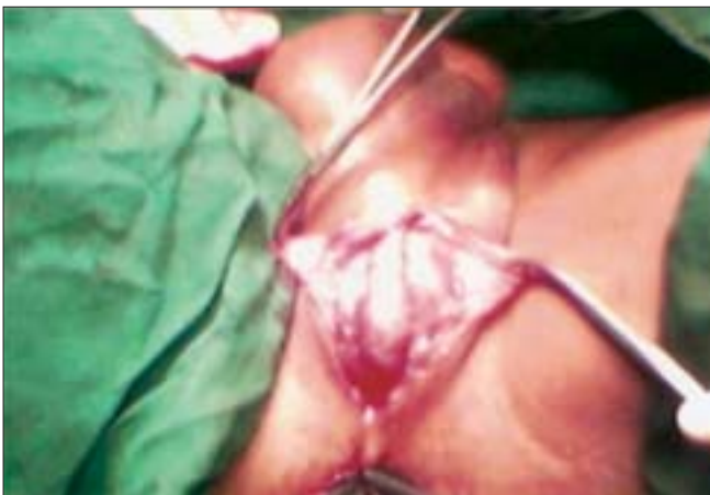
Figure 4: Redundant urethra after excision of the fistulous tract