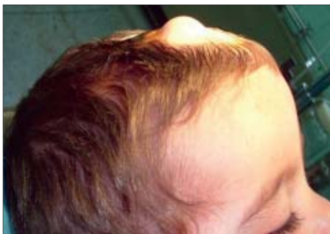
Figure 1: The child with lump around the anterior fontanel