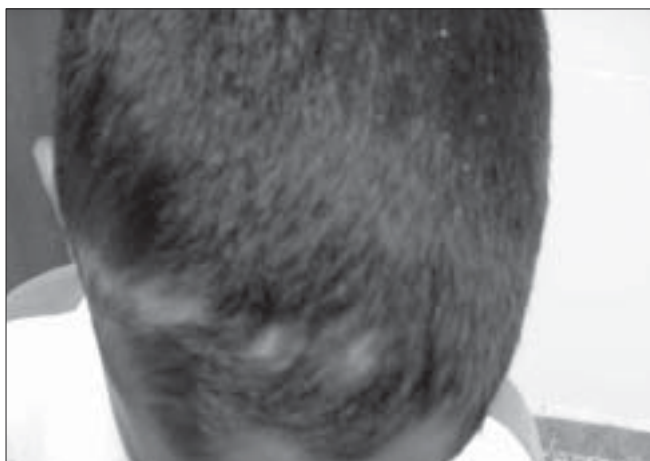
Figure 3: Photography of patient two years after surgery

some cases can be related to the parents' ignorance or their knowledge of the benign nature of the lesion that permits delayed surgery. Although a female predominance has been reported, [4] we could not find any gender difference. The size of the dermoid cyst has usually been 1–7 cm in the previously reported cases, [4] corresponding to the age of the patient at the time of the diagnosis. [2]