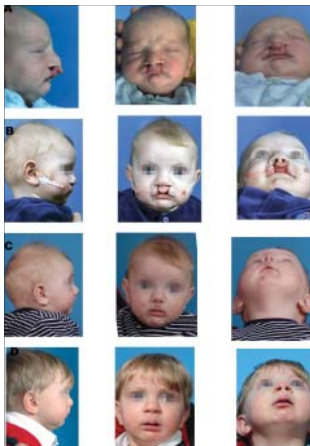
Figure 4: A bilateral complete cleft lip and palate infant treated with NAM therapy. (A) Prenasoalveolar moulding therapy, (B) post-nasoalveolar moulding therapy. Note the non-surgical columella elongation, (C) post-surgical photograph, (D) 1-year follow-up

In bilateral cases, there is a need for two retention arms as well as two nasal stents which are similar in shape to the unilateral stent. After adding the nasal stents in the bilateral cleft, the attention is focused on non-surgical lengthening of the columella. To achieve this objective, a horizontal band of the denture material is added to join the left and right lower lobes of the nasal stent,