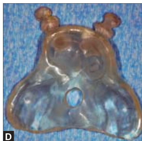
Figure 1: (A) Infant held in an inverted position during the impression process to prevent the tongue from falling back and to allow fluids to drain out. (B) Impression of a unilateral cleft patient using a custom tray and heavy-body silicone impression material. (C) Plaster stone working model of a bilateral cleft patient for appliance fabrication. (D) Bilateral nasoalveolar moulding plate with retention buttons fabricated using self-cure acrylic resin