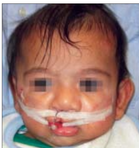
Figure 3: (B) Unilateral NAM plate with a nasal stent showing lip taping.