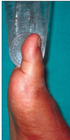
Figure 3: Great toe in active extension and measurement with goniometer

done was active under supervision initially and patient was subsequently trained to do the same all by himself. The postoperative recovery was satisfactory with a small scar line [Figure 2], which healed uneventfully. The range of motion was measured using goniometer. The range of motion postoperatively is 15 degrees of extension and 15 degrees of flexion. The ranges of motion of both sides have been compared in Table 1. Active extension of the hallux is shown in Figure 3. Both active flexion and extension movements have been depicted in the Videos 1 and 2.