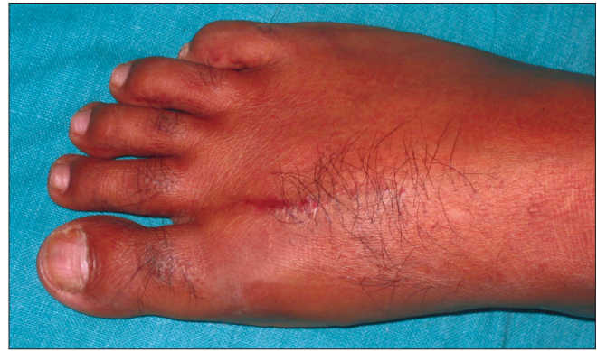
Figure 2: Postop result with healed short scar