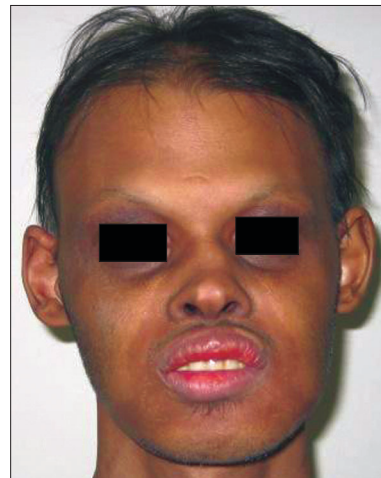
Figure 6: Postoperative photograph of the patient