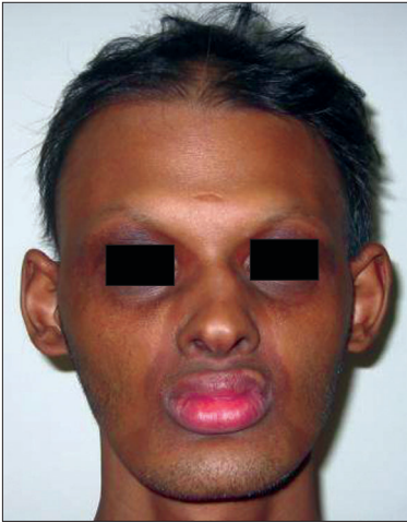
Figure 1: Pre-operative photograph of the patient showing the characteristic facies