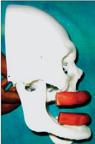
Figure 3: Three dimensional skull model of the patient used to assess the height and the width of the required upper and lower alveolus