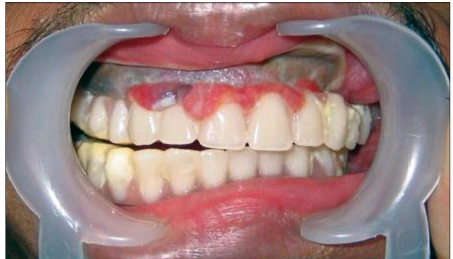
Figure 4: Postoperative intraoral photograph showing the overdentures