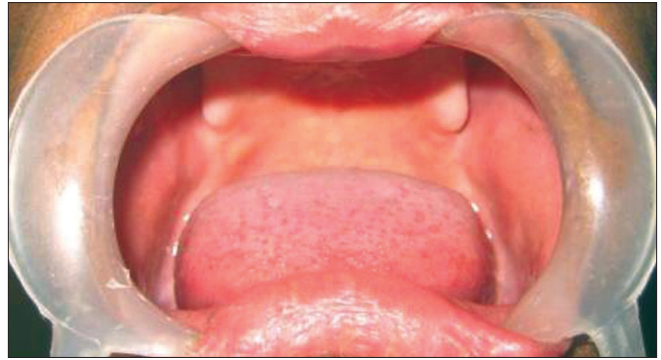
Figure 2: Pre-operative intraoral photograph showing absence of both upper and lower alveolus and complete anodontia