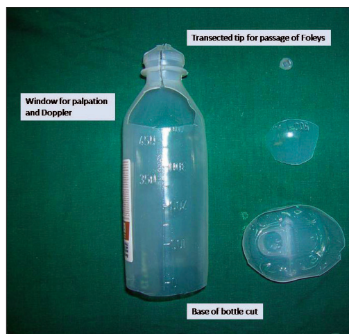
Figure 1: Making of the splint