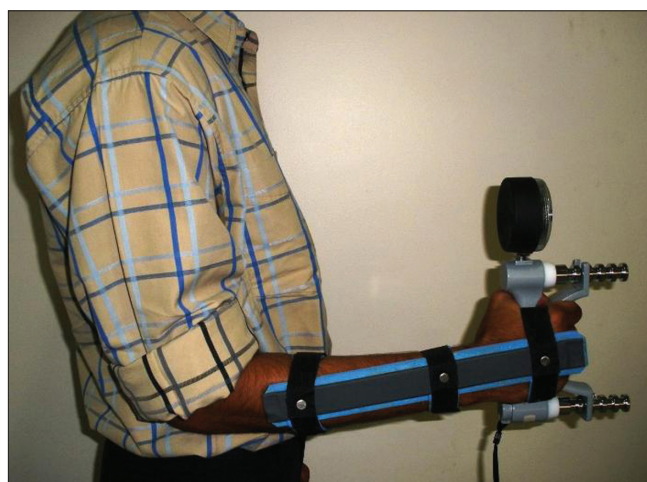
Figure 2: All measurements were taken in standardized position – standing with the arm held flush to the side of body, elbow flexed to 90 degrees, forearm in mid-prone position and wrist in the position determined by the splint

The average grip strength in various wrist positions is shown in Figures 3 and 4. The average grip strength without splint was 34.3 kg at right hand and 32.3 kg at left hand. Grip strength