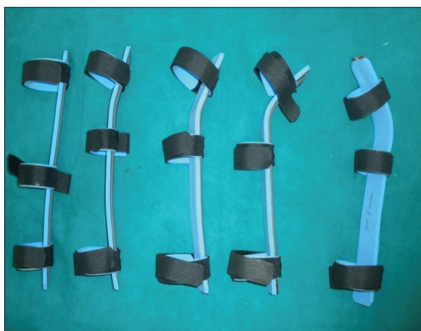
Figure 1: Splints designed to hold the wrist in different positions – 45 degrees wrist extension, 30 degrees wrist extension, 15 degrees wrist extension, neutral wrist position and 30 degrees wrist flexion

Hundred normal healthy adult volunteers working in our hospital participated in the study. The age of the participants ranged from 19 to 56 years (average 29 years). There were 60 males and 40 females. Ninety two of 100 were right-hand dominant and eight were left-hand dominant. For the purpose of this study we designed splints to hold the wrist in five different fixed positions of the wrist – 45, 30 and 15 degrees of wrist extension, neutral wrist position (0 degree wrist extension) and 30 degrees of wrist flexion [Figure 1]. The splints were made with thermoplastic material and an aluminium strip was incorporated over the dorsal aspect to prevent any deformation of the splint and change of wrist position while power gripping. The splint was contoured to attach to the dorsal aspect of the wrist and forearm in order to avoid interference with gripping. It was secured to the limb with one strap in the palm, one just proximal to the wrist and another in the proximal third of the forearm [Figure 2]. The strap in the palm was pliable and thin to minimize interference with grip and allow free rotation of the metacarpals. None of the patients felt the splint was uncomfortable for gripping, or painful.