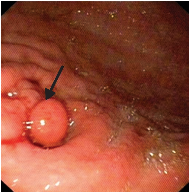
Figure 1: Upper gastrointestinal endoscopy showing a polyp at the gastrojejunostomy site almost completely obstructing the lumen (Arrow)

gastrojejunostomy. Although there are few reports in literature of development of polypoid lesions at the gastrojejunostomy site. 6,7 But there is no report until now of its endoscopic management. Gastrojejunostomy site polyps are usually asymptomatic but they may manifest with features of gastric outlet obstruction as in our patient. Development of these hyperplastic polyps at the gastrojejunostomy site is postulated to be as a result of reflux of enteric contents into the gastric remnant. 8