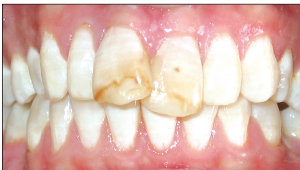
Figure 1. Chalky white appearance of fluorosed teeth.

Before bonding, the facial surfaces of the teeth were cleaned with a mixture of water and pumice. The teeth were rinsed thoroughly with water and dried with oil and moisture-free compressed air. Each tooth was etched with 37% phosphoric acid gel for 30 seconds. Then, all teeth were rinsed with water/spray combination for 30 seconds and