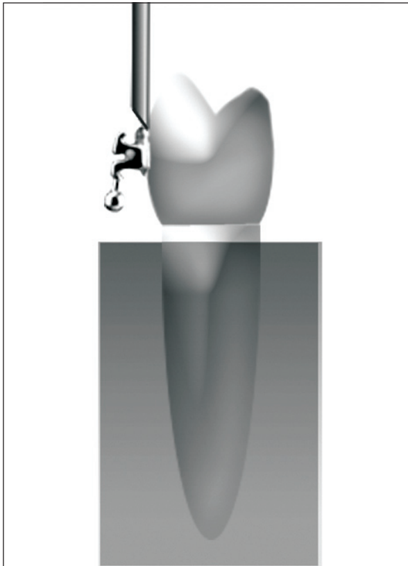
Figure 2. Schematic representation of the specimen in the test machine. The standard knife edge was positioned to make contact with the bonded specimen and directed parallel to the long axis of the crown of the tooth.

The findings of the present study demonstrate that fluorosis significantly reduced the shear bond strengths of the brackets to enamel. The mean shear bond strength of the fluorosed teeth group was 13.94±3.24 MPa, while the control group was 19.29±4.71 MPa. This result is consistent with Weerasinghe et al 7 who reported that severity of fluorosis affected the micro-shear bond strength