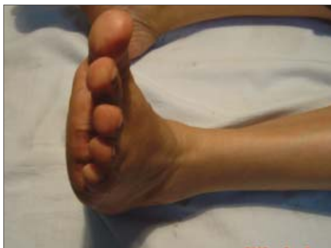
Figure 7: Range of motion of ankle joint in the same patient (Figure 5 )

of antibiotics in 5 patients, we had to remove the suture knots and materials in 6 patients, Nine patients complained of some discomfort and this was perhaps due to reactions around the sural nerve while 2 complained of paresthesia. Minor skin edge necrosis and sural nerve irritation were present in 2 patients each and in one patient with partial dehiscence, we also encountered a fibrotic reaction. The range of motion we obtained is similar to other reports. [8]