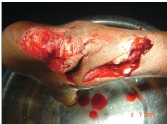
Figure 3: Patient sustained injury at two sites with multiple skin lacerations