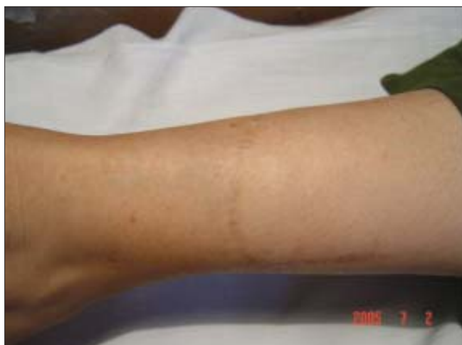
Figure 5: Scar of a patient with tendo achilles repaired 10 yrs. back

complications of prolene sinuses and granulomas are rather high (in 11 patients). This may be related to the presence of foreign body used for repair in contaminated injuries. Although this settled down after repeated courses