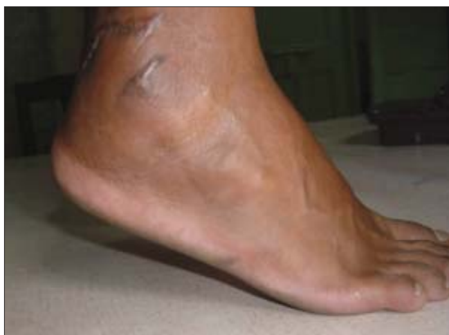
Figure 4: Patient sustained injury 5 months back and is able to stand on toes