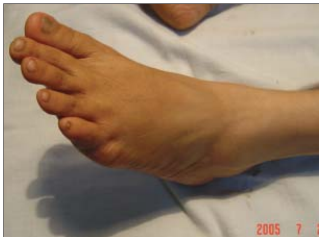
Figure 6: Range of motion of ankle joint in the same patient (Figure 5 )

complications of prolene sinuses and granulomas are rather high (in 11 patients). This may be related to the presence of foreign body used for repair in contaminated injuries. Although this settled down after repeated courses