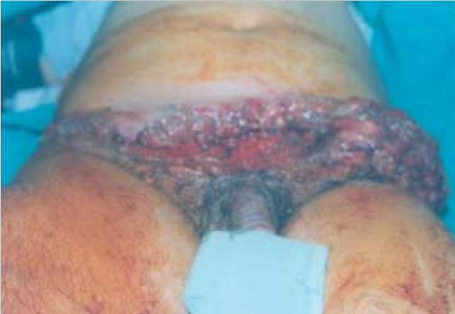
Figure 1: The wound on the anterior abdominal wall