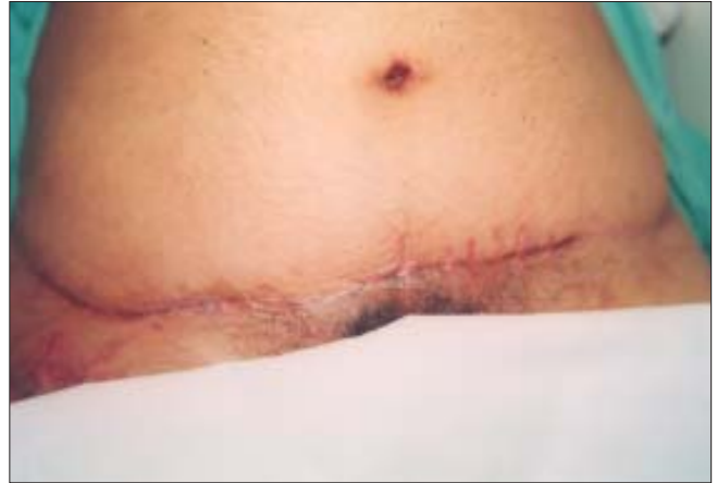
Figure 3: The wound 6 months postoperatively

Reconstructing such wounds is sometimes feasible by direct suturing if the wound is small. But in large defects, skin graft or even local or free flaps may be necessary. [1-4] In our case, the final defect after wound debridement, was too big to be closed primarily without tension, which may cause skin necrosis. So the solution was to mobilise the skin as in an abdominoplasty, but without dissecting out the umbilicus to bring it through a separate site so